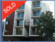
1941 Columbia 2014 Construction Little Italy/Downtown New Construction