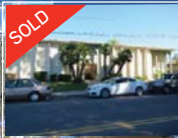
Helix Manor Townhomes 1972 Construction La Mesa, CA (SD-East County)