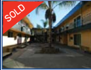
Park Grove Apartments 1963 Construction San Diego, CA (College Area) 98 Units