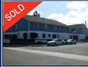
Calla Apartments 1986 Construction Imperial Beach, CA 100% 2BR Units