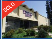
Molokai Apartments 1965 Construction La Mesa, CA (SD-East County) 39 Units