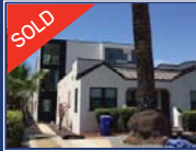
Utah Street Apartments North Park/University Heights New Construction