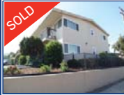
Schoolridge Apartments 1958 Construction La Mesa, CA (SD-East County) 88% 2 BR Units