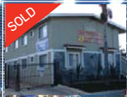
Casa Verde Apartments 1958 Construction (Renovated) La Mesa, CA (SD-East County) 95% 2BR Units