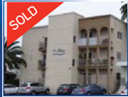
The Tides 1968 Construction La Jolla, CA 30 Units