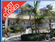
1951-57 Front Street Bankers Hill/Uptown 47 Unit Portfolio Sale