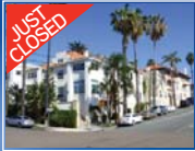
2011 Front Street Bankers Hill/Uptown 47 Unit Portfolio Sale