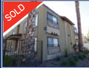
Southwinds Apartments 1977 Construction El Cajon, CA (SD-East County) 100% 2BR Units