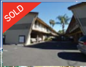
Orlando Woods 1960 Construction El Cajon, CA