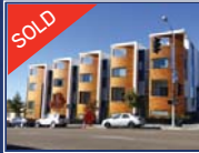
TEN on Columbia Downtown San Diego (Little Italy) New Construction