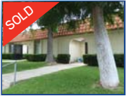
1121 N. Escondido Value-Add Opportunity Escondido, CA 13 Units