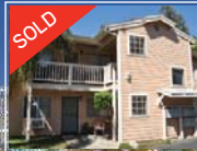
Old Stage Apartments 1987 Construction Fallbrook, CA