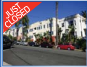
2027 Front Street Bankers Hill/Uptown 47 Unit Portfolio Sale