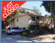
801-07 Torrance Street Mission Hills/Hillcrest 47 Unit Portfolio Sale