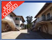
715-39 Torrance Street Mission Hills/Hillcrest 47 Unit Portfolio Sale