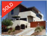
Louisiana Apartments 2012 Construction North Park New Construction