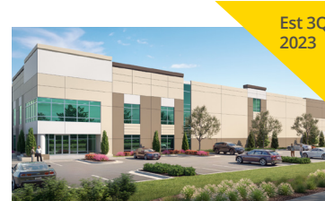
BLDG 4 | 220,606 SF