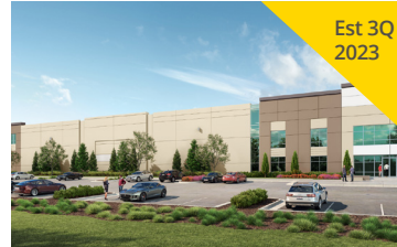
BLDG 3 | 229,934 SF