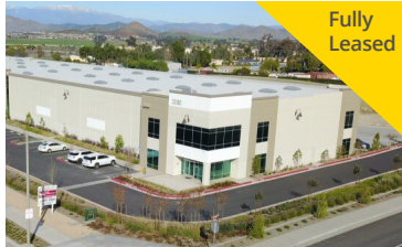
BLDG 1 | 72,835 SF