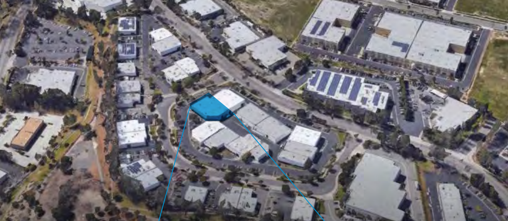
SITE PLAN AERIAL