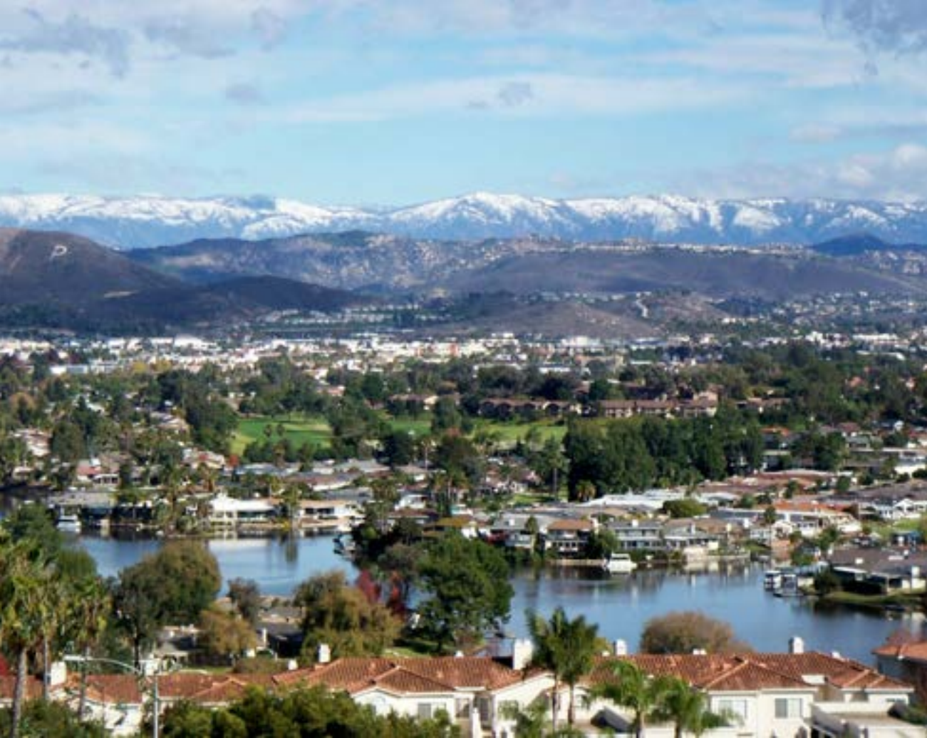
Lake San Marcos