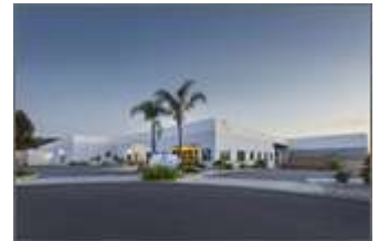
Map Page: Thomas Bros. Guide 1129-A1

Sale Date: 09/05/2018 (491 days on mkt) Sale Price: $3,800,000 - Confirmed Price/SF: $156.86