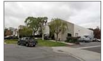
Map Page: Thomas Bros. Guide 1108-B6

Recorded Buyer: Rexford Industrial Realty LP Recorded Seller: Sonoma Oaks, LP 11620 Wilshire Blvd Los Angeles, CA 90025 True Buyer: Rexford Industrial Realty, Inc. True Seller: Wilbur-Klein Capital, Inc.