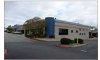
Map Page: Thomas Bros. Guide 1087-G7

Recorded Buyer: Ncths Facilities Llc True Buyer: North County Trade Tech High