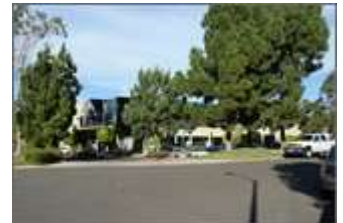
Map Page: Thomas Bros. Guide 1108-B6

Sale Date: 11/06/2018 Sale Price: $3,710,000 - Confirmed Price/SF: $154.49