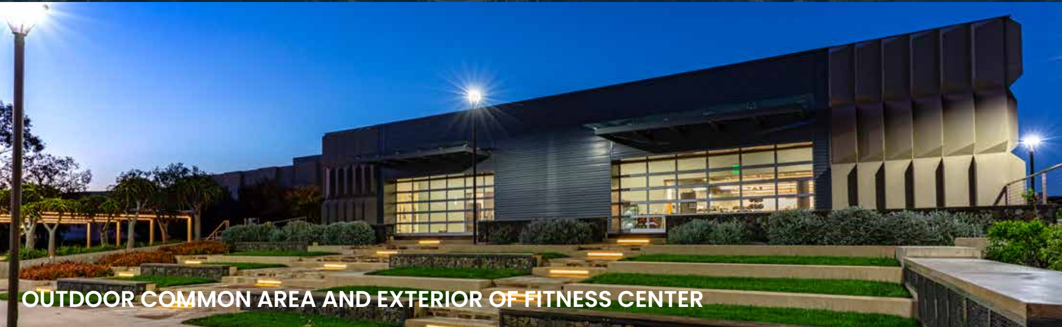
OUTDOOR COMMON AREA AND EXTERIOR OF FITNESS CENTER