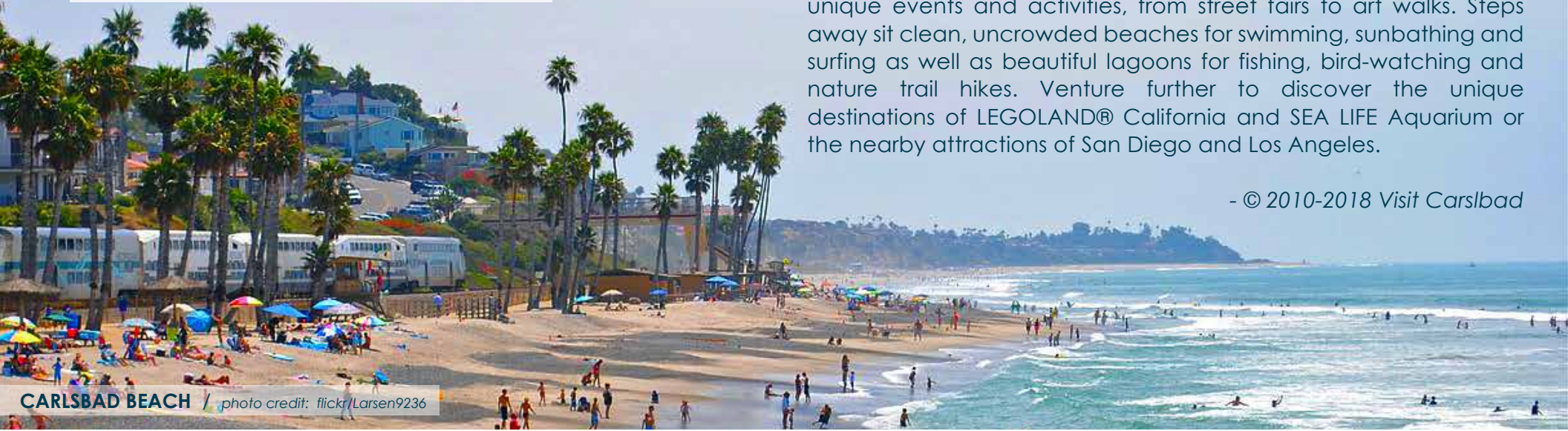
CARLSBAD BEACH