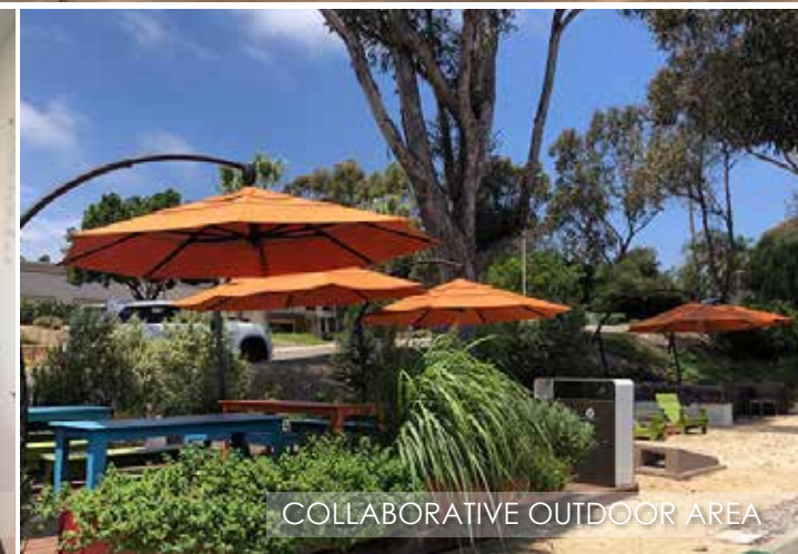
COLLABORATIVE OUTDOOR AREA