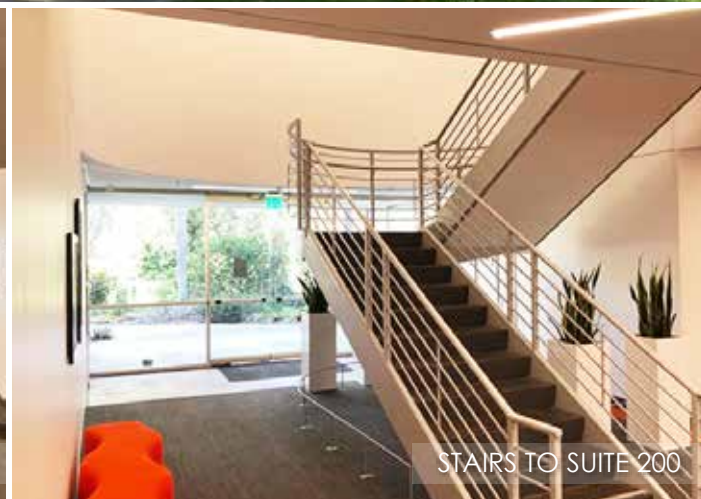
STAIRS TO SUITE 200