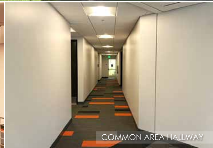
COMMON AREA HALLWAY