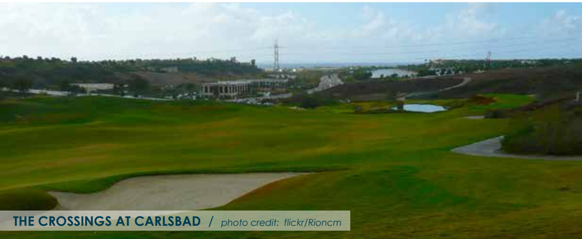
THE CROSSINGS AT CARLSBAD