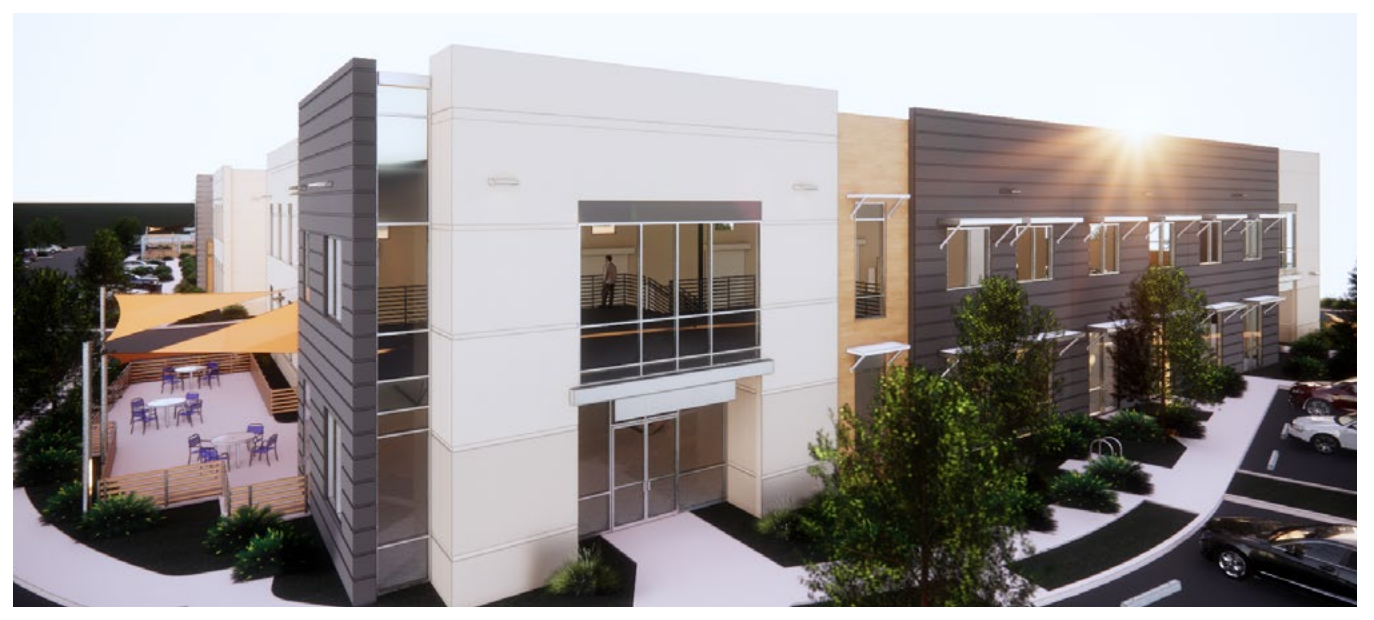
BUILDING A First Floor: 14,633 SF Second Floor: 2,786 SF