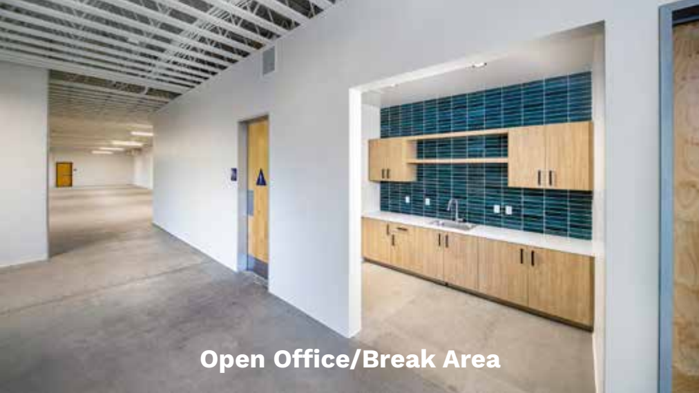
Open Office/Break Area