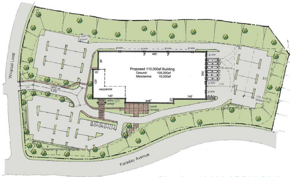
Plan A - 110,000 SF BUILDING