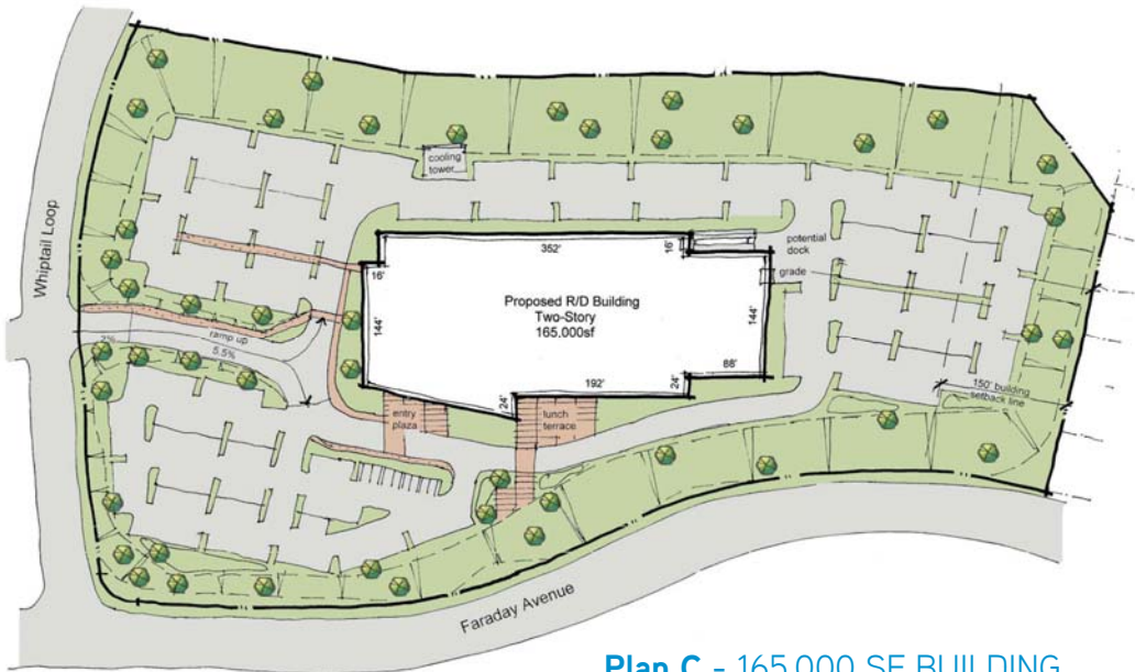
Plan C - 165,000 SF BUILDING

TED CUTHBERT 858 636 7988 CARLSBAD, CA ted.cuthbert@colliers.com Lic# 00964042