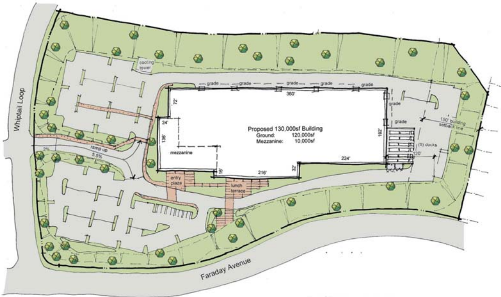
Plan B - 130,000 SF BUILDING