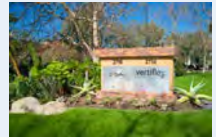
ATRIUM II CORPORATE CENTER