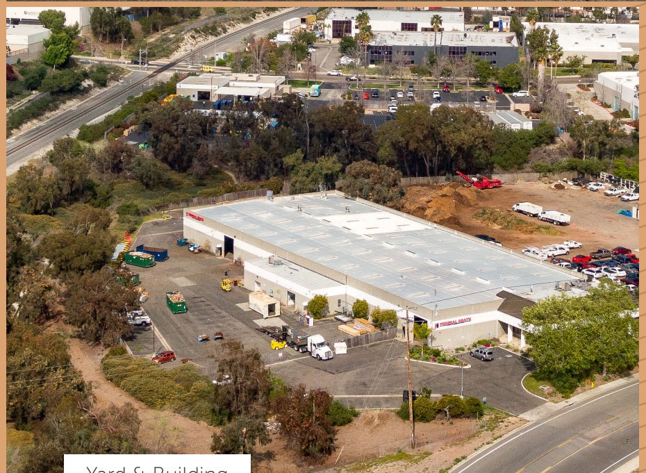
Yard & Building